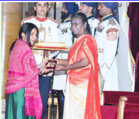
President presenting the Padma Vibhushan Award to Prof. Balkrishna Doshi (Posthumous)

New Delhi, March 22 President, Smti Droupadi Murmu today conferred 52 Padma Awards for the year 2023, at a Civil Investiture Ceremony held at Rashtrapati Bhavan. She conferred two Padma Vibhushan, four Padma Bhushan, and 46 Padma Shri awards. President