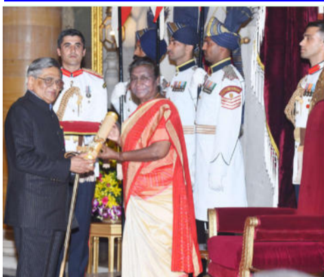
President presenting the Padma Vibhushan Award to Shri Somanahalli Mallaiah Krishna